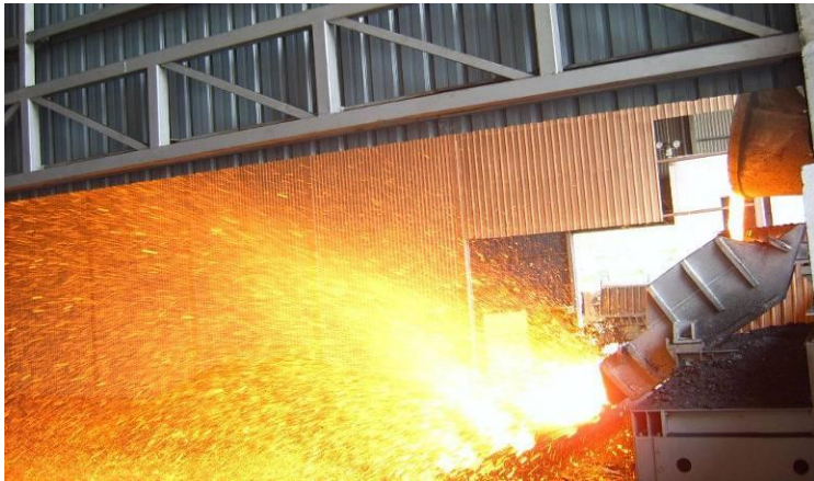
Slag Atomizing Technology is a new process that makes PS Ball blasting media.