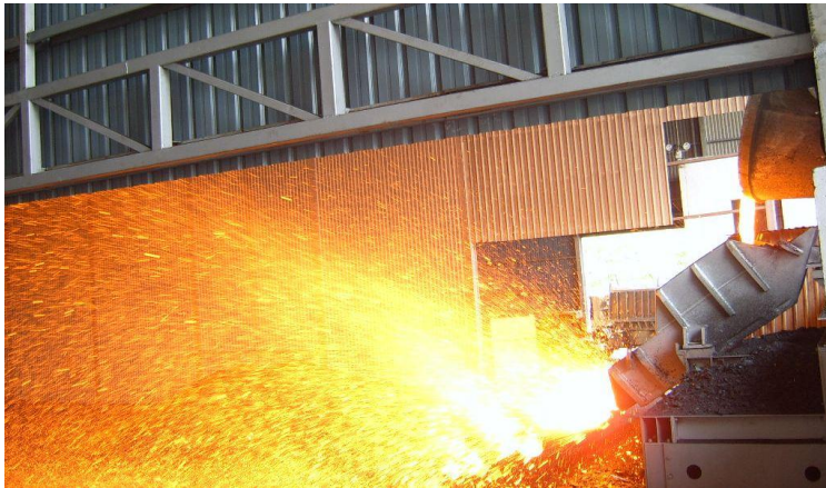
Slag Atomizing Technology is a new process that makes PS Ball blasting media.