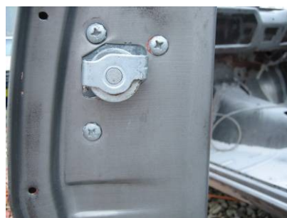
Door after Sodablasting